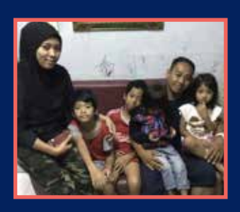
ANSAR & FAMILY Fundraised to defray the family's groceries expenses